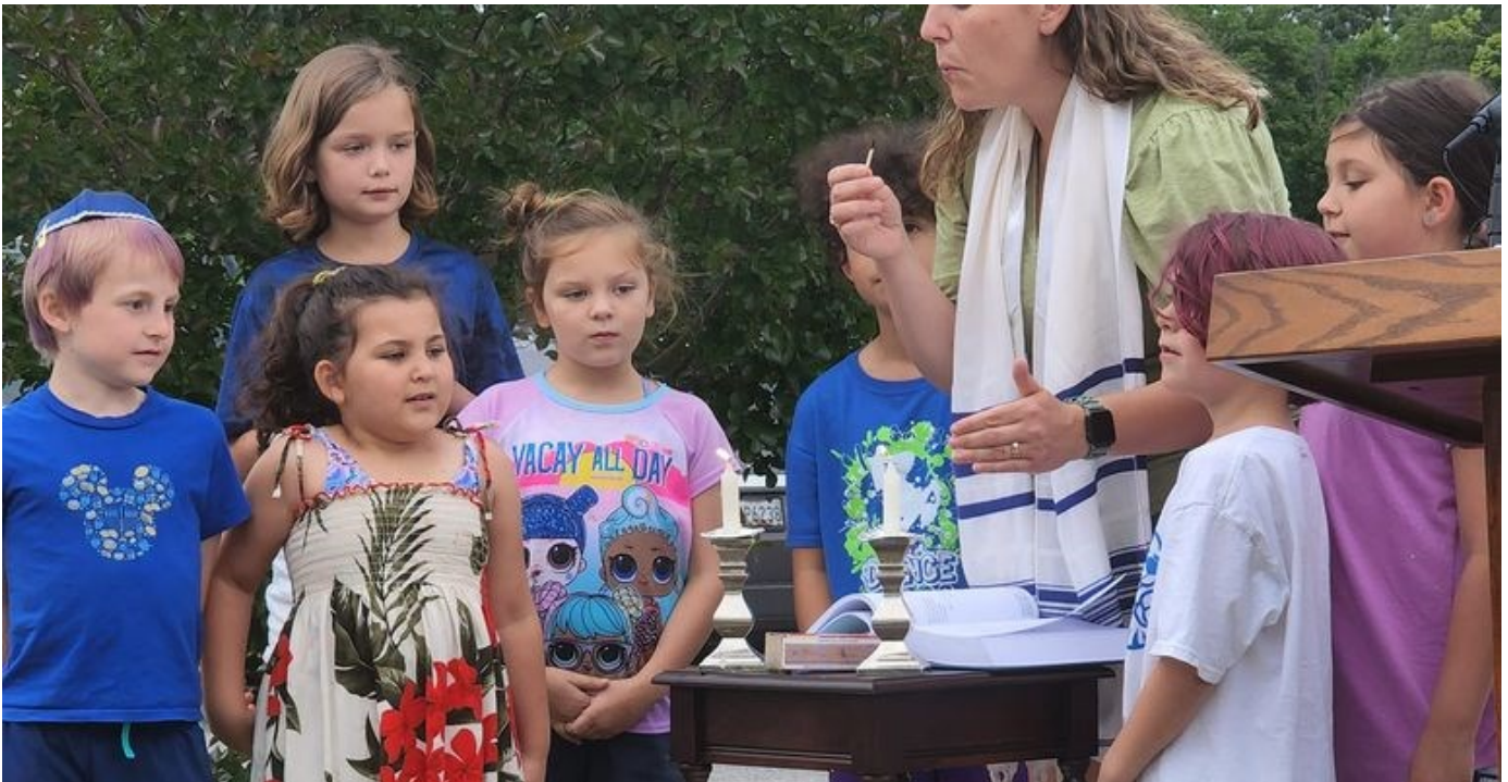
Religious school students participate in Hot Shabbat, June 2023

Secondary II: At this age, students begin to focus more intensively on preparations for their Bar and Bat Mitzvahs and on their future adult roles in religious services. Students have the opportunity to plan and lead the Sunday School family service.