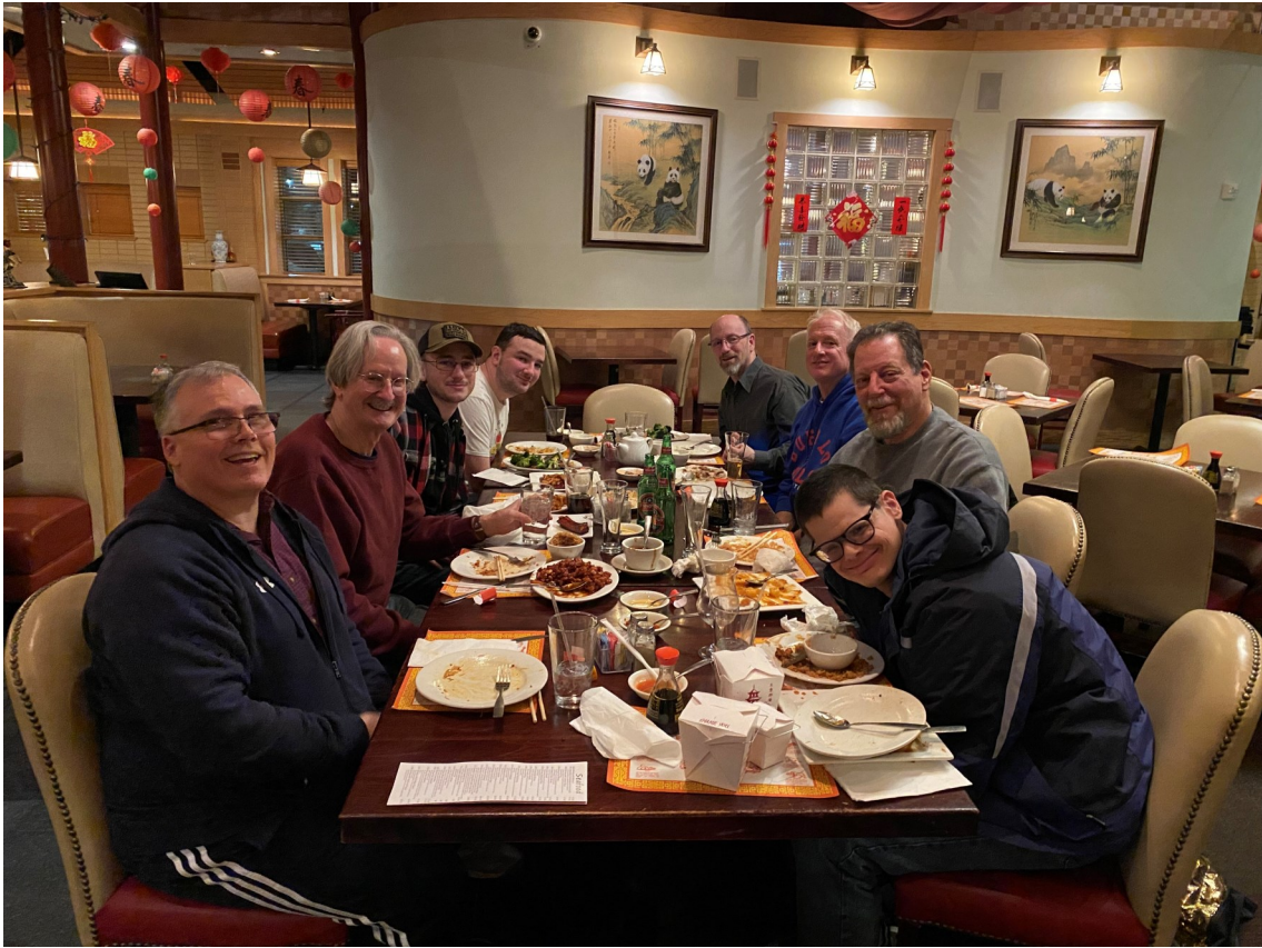
Men's Dinner at Szechuan Garden, January 2024