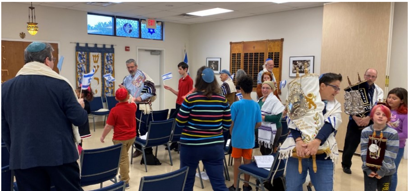
Simchat Torah, October 2023