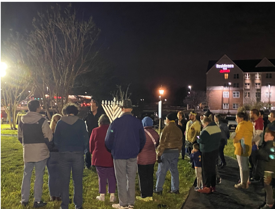
Community menorah lighting cele- bration, De- cember 2023