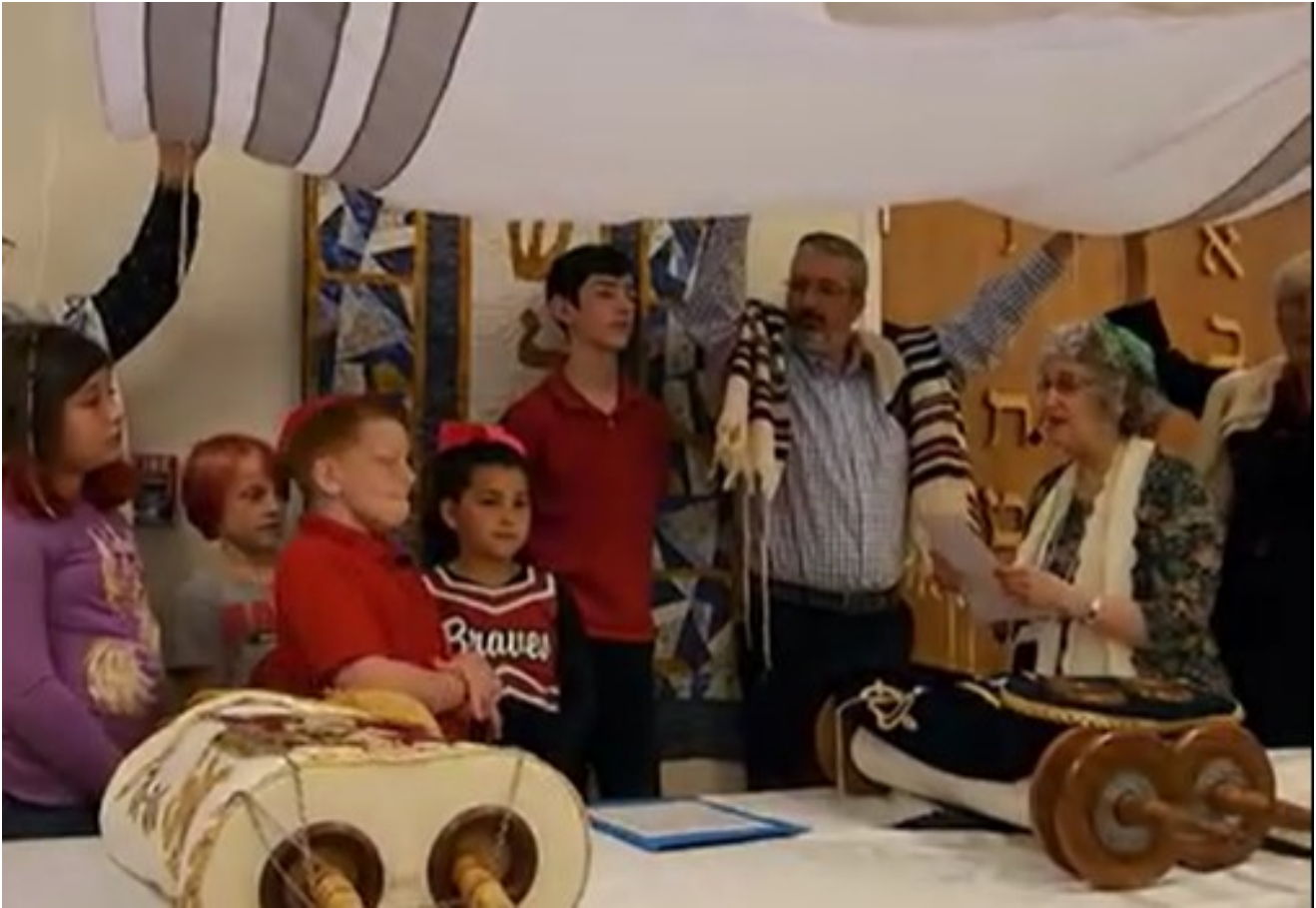
Religious school students receive a blessing at Simchat Torah, October 2023