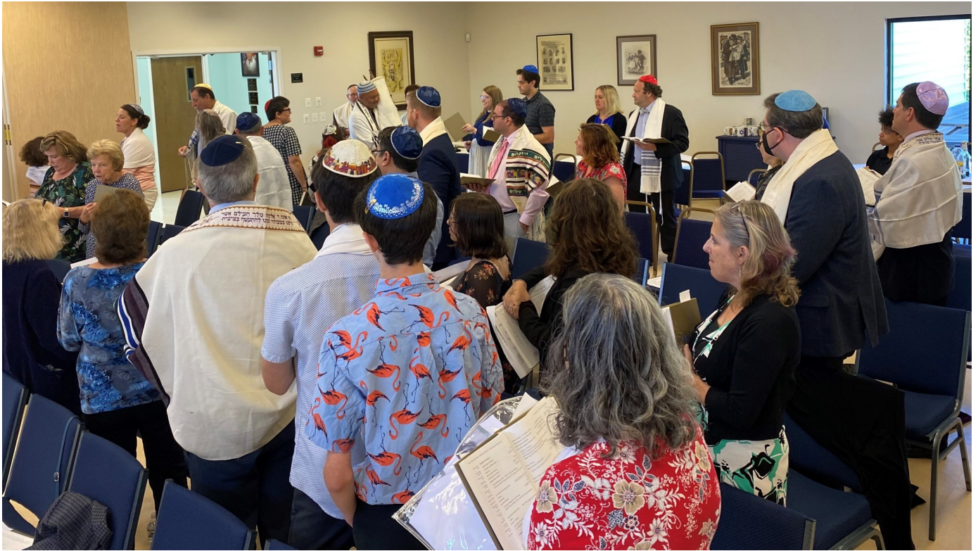
Rosh Hashanah, September 2023