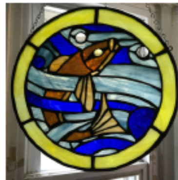
Fish in Ribbon